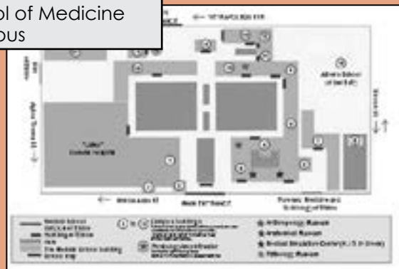
School of Medicine Campus